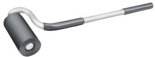
Figure 5 Laminate Roller